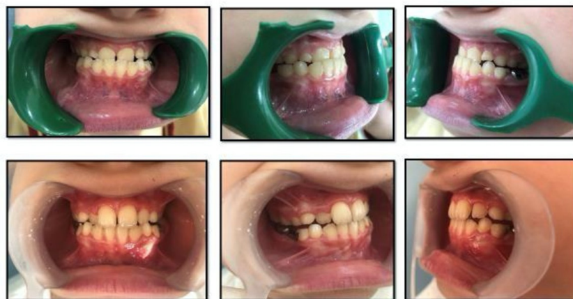
Figure 1. Intraoral view before and after the treatment

Analysis of the data from the soft tissue measurements of the patients before and after the treatment exhibited statistically significant differences in the values for the lower facial height, lower labial length, the vertical length of the chin, nasomental angle, convexity angle, and mentolabial sulcus depth (respective p-values: 0.004; 0.002; 0.007; 0.001; 0.010 and 0.009). Data showed no statistically significant difference in the values for upper facial height, mid-facial height, and nasolabial angle (respective p-values: 0.379; 0.277 and 0.460) (Table 2).