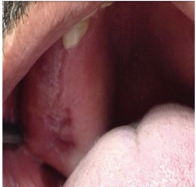
Figure 1. Intraoral photographs, swelling at the right maxillary posterior region of the patient

A 50-yr-old Caucasian man patient was referred to oral and dentomaxillofacial radiology clinic with a chief complaint of unilateral painless swelling of the right maxillary posterior region. It was learned that tooth extraction done years ago because of dental caries. He stated that swelling had occurred in the same area 8 or 10 years ago and had been removed by surgical approach. His medical history was unremarkable, and the neurological examination was normal. In clinical examination, swelling was observed at the right maxillary posterior region and lesion caused painless palatine-vestibule expansion (Figure 1). The overlying mucosa was in normal appearance. In panoramic radiographic examination, partially edentulous maxilla