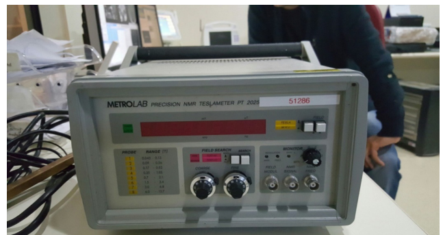
Figure 2. A Tesla-meter used for the measurement of strength of location shown in Figure 1