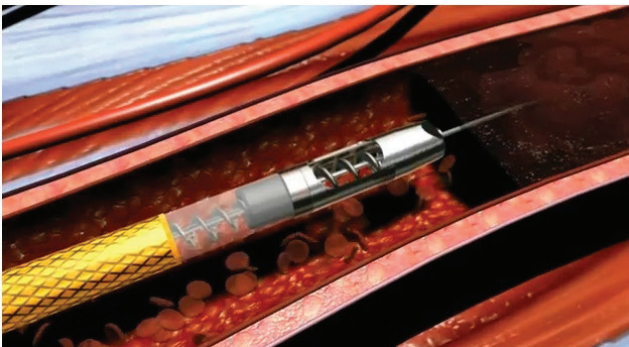
Figure 1. Rotational thrombectomy device

part is covered with a nitinol scaffold were designed to overcome this problem, (Figure 1). The mechanism of action for devices working through rheolytic effect is to drag and remove the thrombus into the device with the help of a “vortex” formed by spraying high-speed fluid onto the thrombus (Figure 2). These devices are suggested to cause less endothelial and valvular damage compared to rotational devices since there are no moving parts in direct contact with the vessel wall (30). However, it was asserted that release of adenosine and potassium as a consequence of hemolysis caused by administration of high-pressure fluids, may lead to bradycardia (43). Ultrasound-mediated devices cause expansion and loosening in the fibrin structure of thrombus through emission of radial, high frequency, low-energy waves. Thus, the permeability of the thrombus is increased, resulting in an increased exposure of plasminogen receptor sites to thrombolytic agent thus enhancing the impact of thrombolysis. Such devices were suggested to cause less endothelial damage when compared to rotational