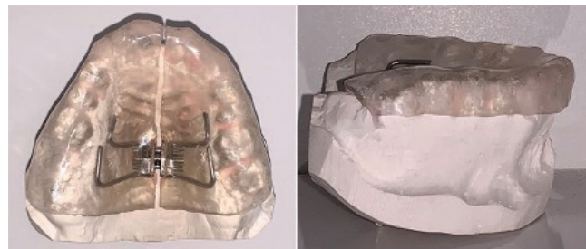
Figure 1. The modified acrylic bonded maxillary expansion appliance which has occlusal coverage of all the maxillary teeth

BBT was evaluated considering a previous study (9). Root length was determined as the distance from the horizontal reference line which was made at the radiographic level of CEJ to the root apex. Two points